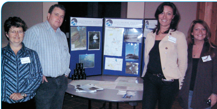
Southern Pacific held a community open house at Fort McKay in January 2009.