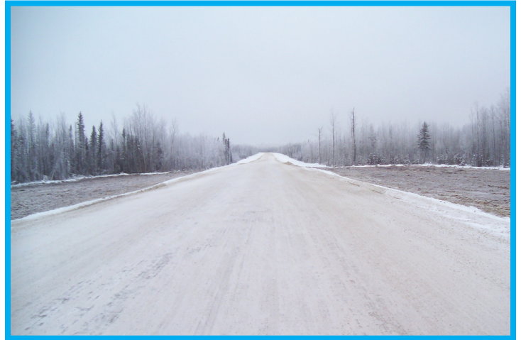
Southern Pacific and partner construct all-season access road in late 2010.

As part of the consultation process, Southern Pacific will consult with several Aboriginal communities, First Nations, Metis locals and public stakeholders within the region.