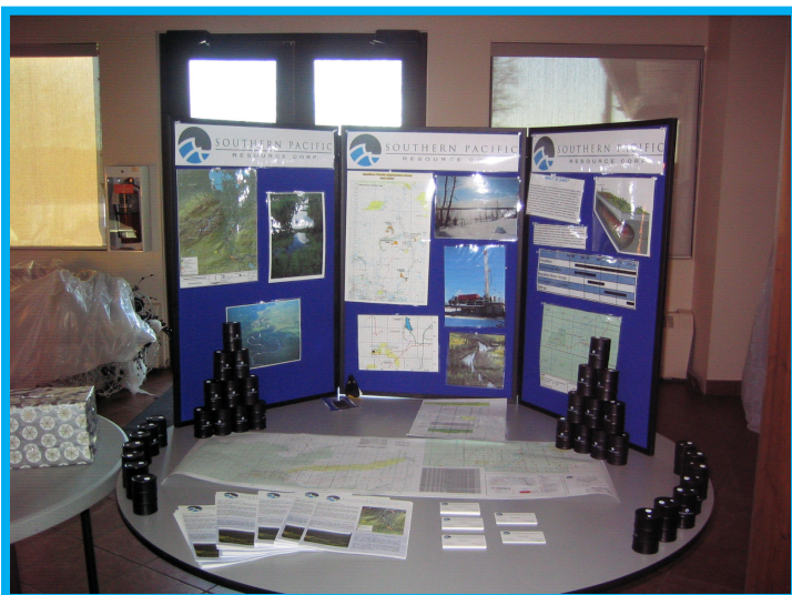
Southern Pacific held a community open house at Fort McKay in January 2009.